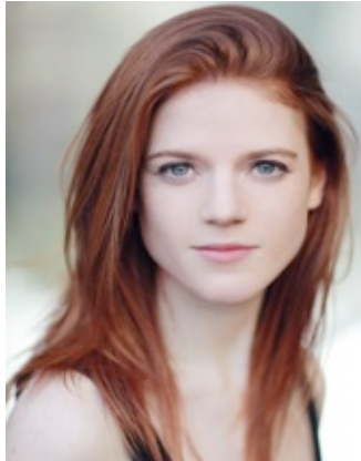
ROSE LESLIE (Bea)

Rose Leslie trained at The London Academy of Music and Dramatic Arts (LAMDA).